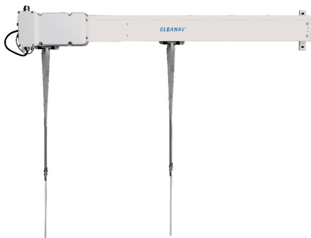
Standard Parking System