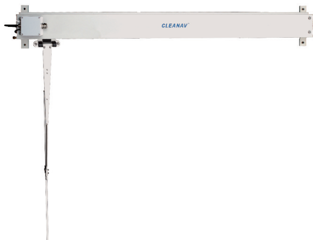
Internal Motor Drive