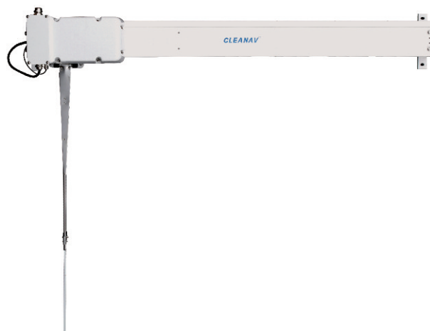
External Motor Drive